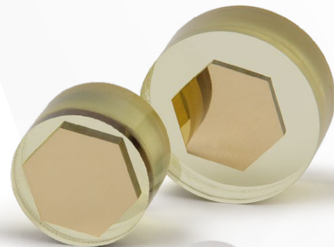
Mounted samples after polishing