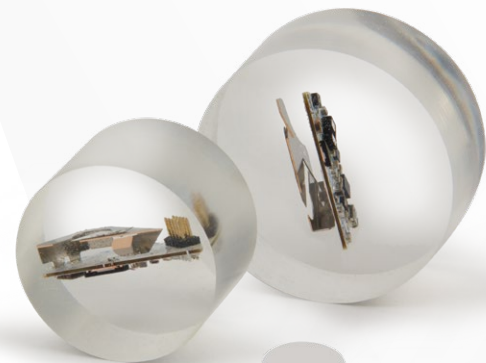
Mounted samples after polishing