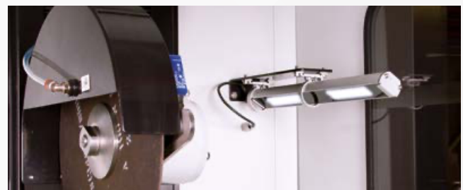
Work area lit by LED strip