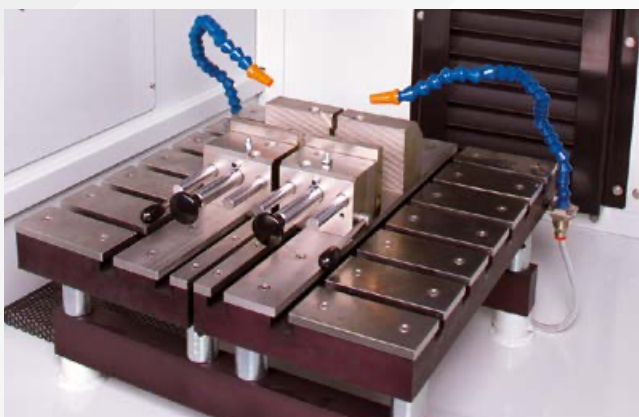
A spacious cutting chamber: W 408 x D 422 mm with openings on both right and left sides for the cutting of long samples.